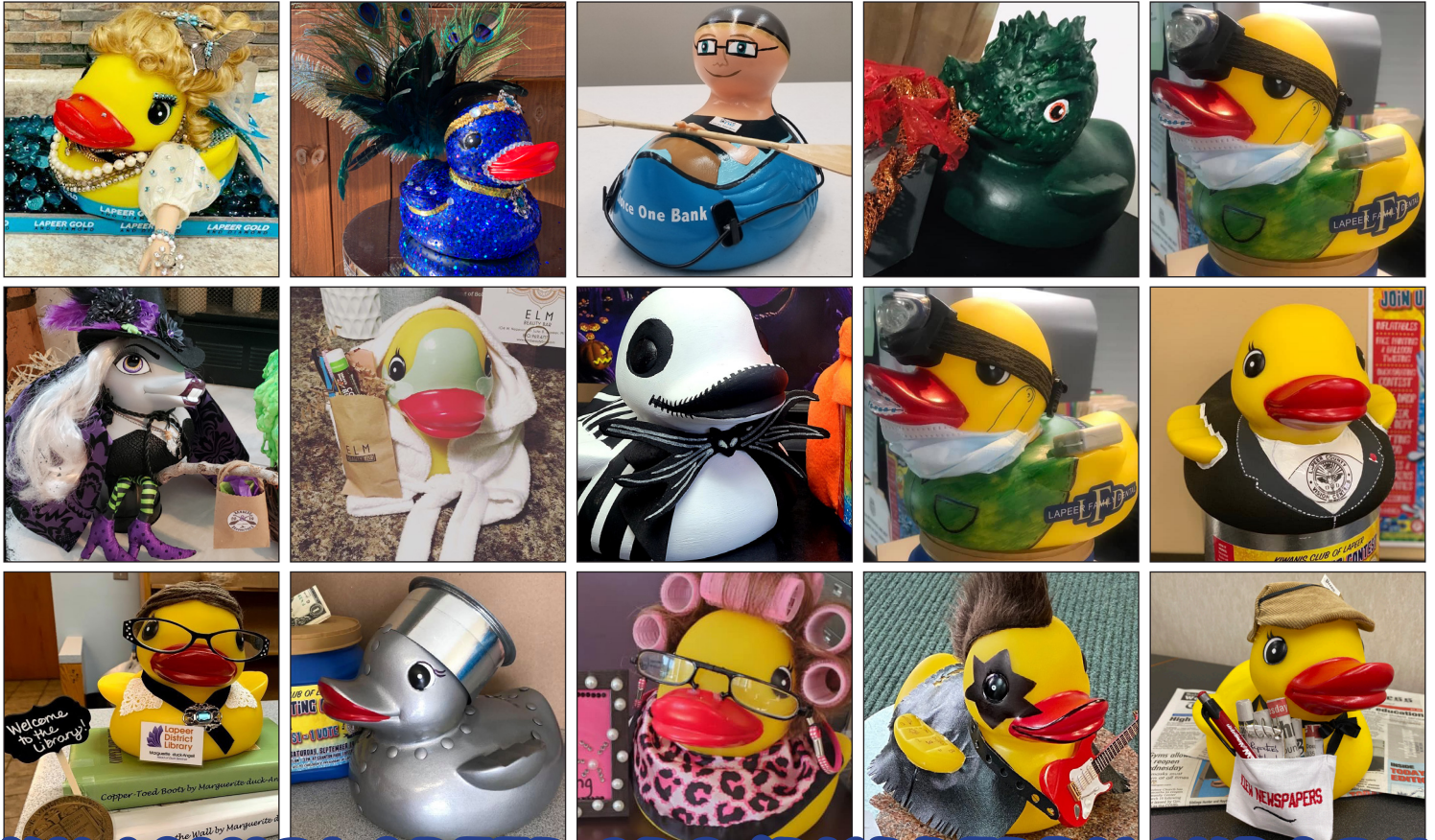
Examples of decorated ducks from past contests:

Contact your favorite Kiwanian or email us at lapeerkiwanis@gmail.com with questions or to sign up. See other side for complete "How It Works" information.